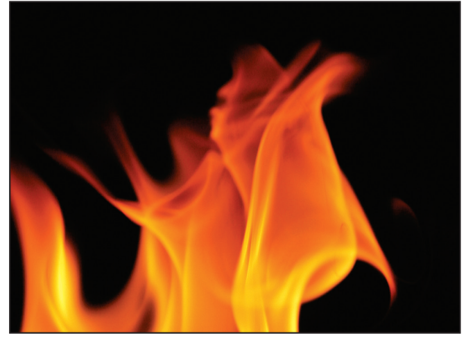
Upgrades the fire performance of previously painted surfaces

Contact Tor Coatings on 0191 410 6611 to arrange your free site survey.