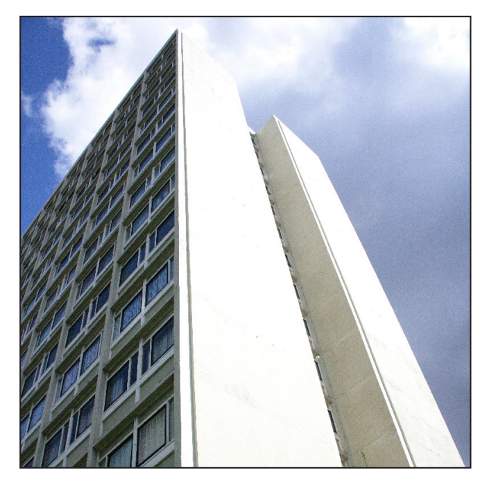
Ideal for decorating communal areas of buildings