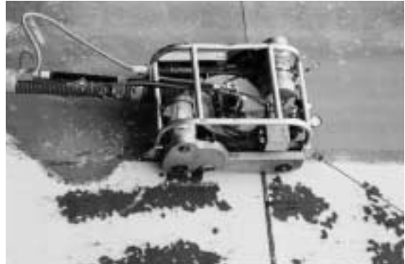
Figure 4. Ultra-high pressure water jetting of steel barrier gates.

Ultra-high pressure water jetting is an extremely versatile and effective method of removing paint and metal coatings, soluble salts and other contaminants from steel surfaces. It is environmentally friendly and, although at present costly compared to traditional blast cleaning methods, it is considered to be an emerging technology which will, in the near future, rival and possibly replace traditional open abrasive blast cleaning methods.