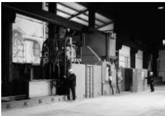
Figure 1. Modern automatic shot blast plant.

compressed air or by centrifugal impellers. The latter method requires large stationary equipment fitted with radial bladed wheels onto which the abrasive is fed. As the wheels revolve at high speed, the abrasive is thrown onto the steel surface, the force of impact being determined by the size of the wheels and their radial velocity. Modern facilities of this type use several wheels, typically 4 to 8, configured to treat all the surfaces of the steel being cleaned. The abrasives are recycled with separator screens to remove fine particles. This process can be 100% efficient in the removal of mill scale and rust.