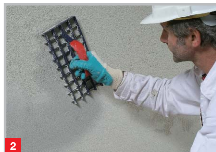
SCRATCHING RESTORATION RENDER SURFACES

The appropriate Plaster System is applied with minimum 24 hours between layers. Intermediate layers must be prepared for the next layer by scratching and scoring when wet.