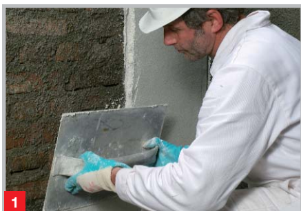
APPLYING RESTOATION RENDER

of three levels “low”, “medium” or “high”, dependent on the percentage salt content. Refurbishment Render/Plaster systems also act as a moisture-regulating protection system for the internal waterproofing.