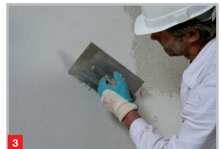
APPLYING FINE RENDER

The stiffened Restoration Render surface is prepared for application of the following finishing plaster with a special float.