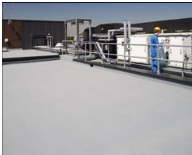
Above: Elastaseal™ used on the roof of a food processing factory

* this reinforcing mat is applied into the wet embedment coat